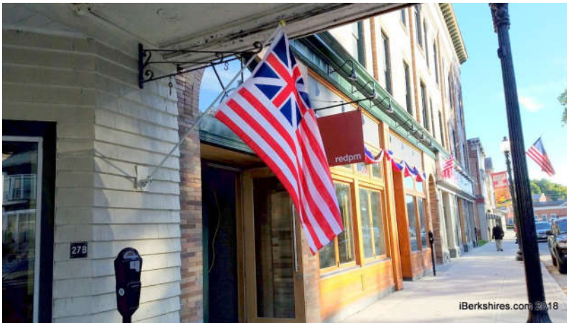
The developer REDPM opened an office in the former Woolworth building last fall.

The Stensons purchased the structure as Braytonville LLC for $60,000 and are developing it through their real estate management firm REDPM, which stands for real estate development property management. Exterior work on the 1920 brick structure was largely completed in 2013. REDPM matched a $125,000 federal grant the town received in 2011 to overhaul the exterior and storefronts and the got a $700,000 MassDevelopment in 2014 for interior work.